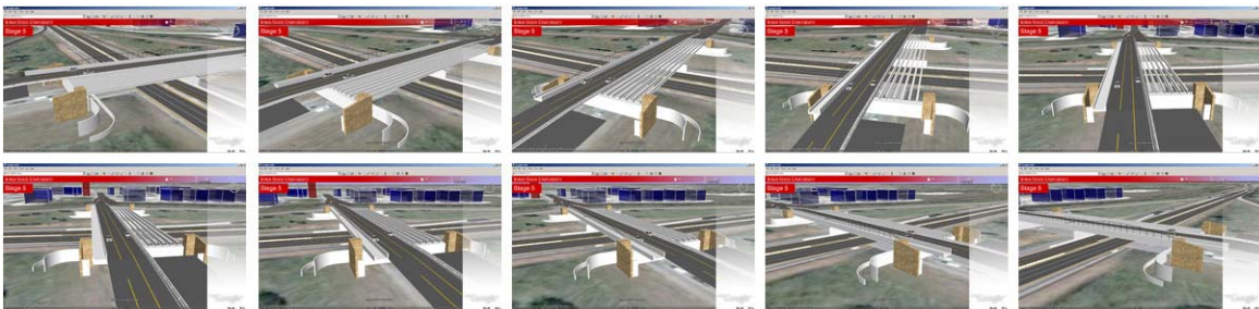
Figure 2. Previous work zone visualization displaying different snapshots of a project at Stage 5 from different perspectives

For the software side, the main benefit of this visualization and simulation is the use of an open platform software program. This feature means that all data files are saved and kept in open formats that should be available to anyone without the need for expensive proprietary software,