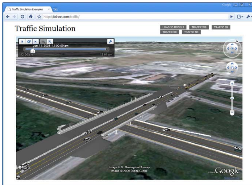
Figure 5. Traffic simulation with traffic volume displaying in a web browser

A screenshot of the traffic simulation is displayed in Figure 5, which shows a work zone with traffic volume.