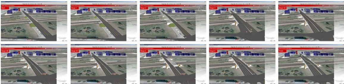
Figure 1. Previous work zone visualization displaying different snapshots of a project from start to finish from the same perspective

The animation developed in the initial study shows a 4D simulation that displays work zones using 3D models during different time periods. Users can easily see different work zone configurations by placing the time navigation bar on a specific time period, as displayed in Figure 1. The 3D model is beneficial for displaying a similar set of data in a single visualization window. All of the 3D models can be linked to allow the program to run as an animation to show how the work zone transitions from one phase to another phase, emphasizing what aspects remain the same or change between each phase. The primary benefit of the 4D animation is that it eliminates the tedious job of flipping back and forth on traffic control plans to identify what aspects are the same or different from several sheets of construction drawings. Another benefit of the full 4D model, as displayed in Figure 2, is that it is able to display different perspectives of the same models. The models can be controlled in three-dimensional navigation, which allows users to freely zoom and rotate within the graphic model. Users can see every view in real time, unlike with 3D animations, which typically allow users to view select sides of models provided by the animation creators. The users can perceive the full benefit of three-dimensional data, such as overlapping or interfering objects.