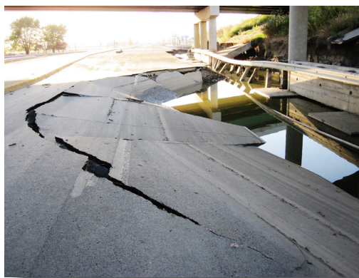
(Sept. 2011) Damage to Highway 2 in Fremont County at the I-29 underpass.

The Missouri River Authority is an interagency, interstate group that makes recommendations on policies affecting the Missouri River. Ω