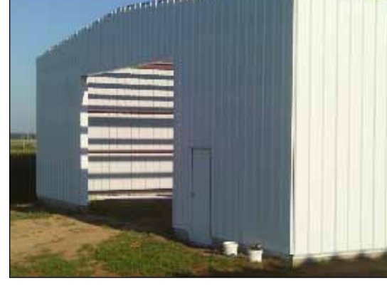
Inmates constructed this new building at Newton for

Since 2006 IPI Farms have provided 71,855 inmate training hours!