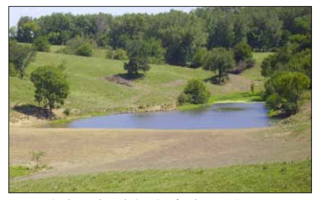
Pond repaired near the Dairy Barn farm location in Anamosa.

Like the other Iowa Prison Industries divisions, IPI Farms receive no government appropriation and are 100% self funding. IPI Farms operate using a dedicated revolving fund, and must manage their payroll and cashflow much like any main-street business.