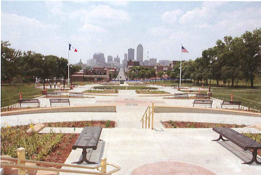
Preparations underway at West Capitol Terrace for the 2007 Hy-Vee Triathlon