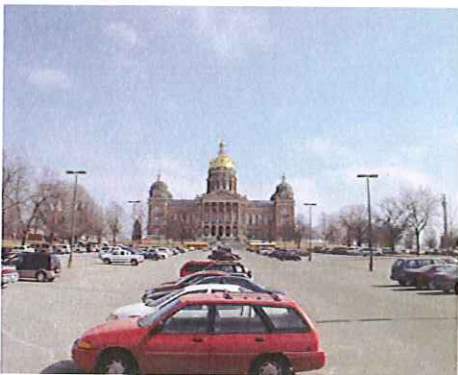
West Capitol Terrace—Before ...

The Commission has also recommended the development of a significant fountain feature—possibly costing up to $1 million—as the centerpiece for this new park. The Commission has formed a task force to provide further recommendations on the design of this major feature and to offer recommendations on possible public-private partnerships for its funding.