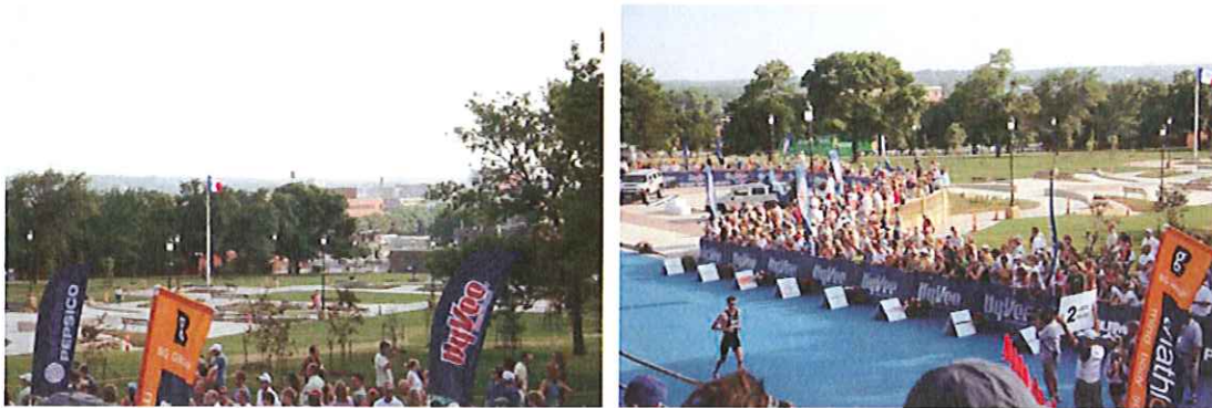
Race Day at West Capitol Terrace