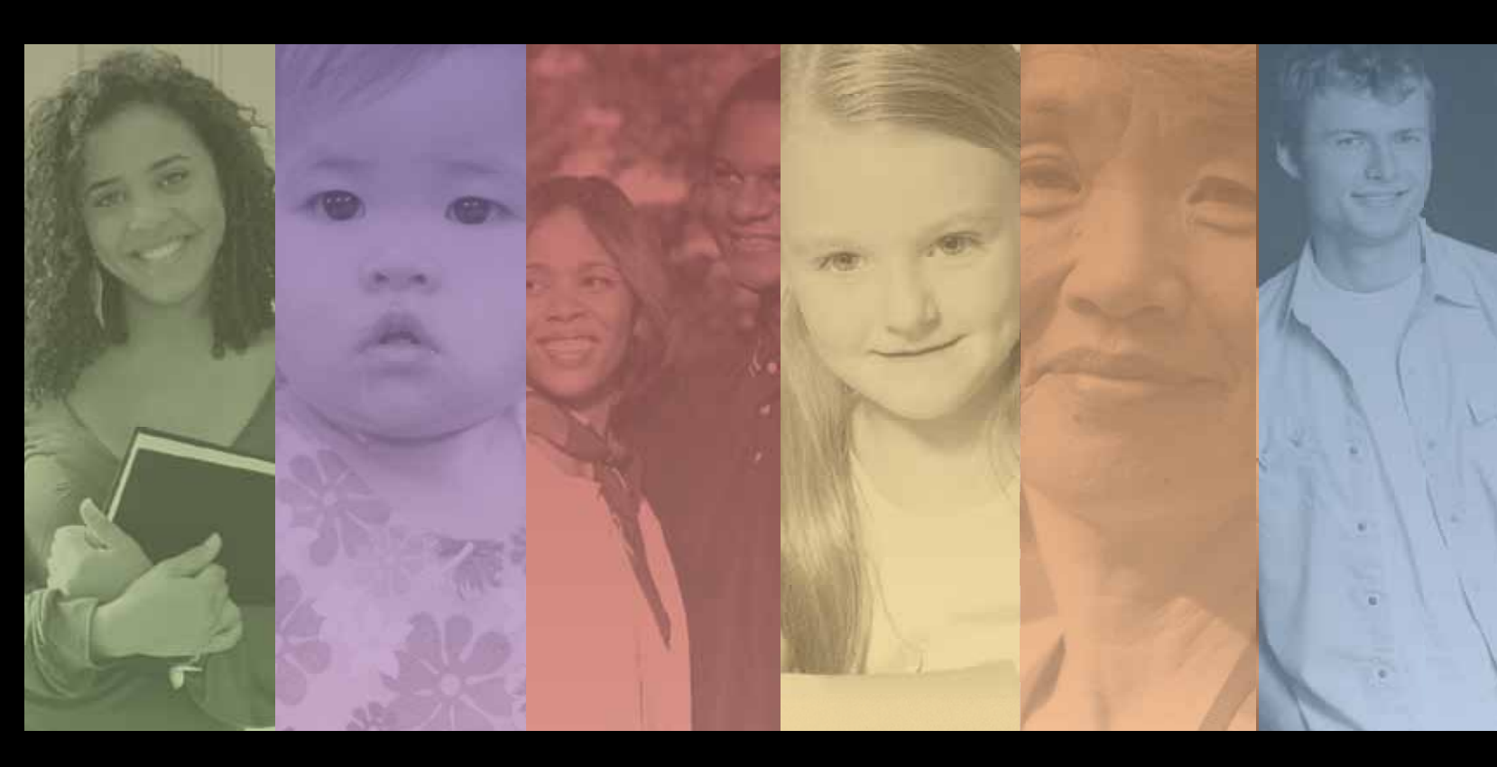
The Iowa Department of Public Health, Immunization Program IOWA IMMUNIZATION CONFERENCE

For Additional Information contact: www.trainingresources.org or call 515-309-3315