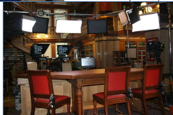
Bottom Picture: CBS' Caucus 2012 staged set in the State Law Library in the Capitol.