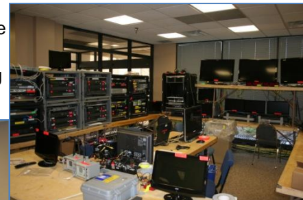
Top Picture: CBS' news room in the Iowa Building.

To ensure that broadcasts on the Capitol Complex aired successfully, DAS purchased ICN's stand-by technical support the days preceding and throughout the night on January 3.