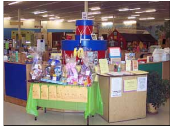
Phase Two: Gift Shop