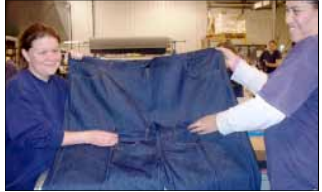
IPI Mitchellville offender workers with the biggest and smallest jeans Textiles has made to date.

large institutional clothing items for a few extra-large offenders. In order to clothe these offenders, Textiles dropped everything to develop workable patterns for and sew 6 pair of 60" x 32" jeans, 6 pair of 58" x 34" jeans, and 5 pair of size 11XL sweatpants – all with the same high-quality standards as our smaller sizes. The results created a fun moment for everyone involved.