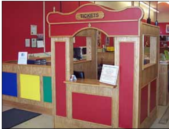
Phase One: Office Area / Ticket Booth

Iowa Prison Industries recently manufactured and installed the last of three large displays for the Children's Discovery Center in Clinton. Design for the Felix The Clown circus theme project began in October of 2009, with production in the Anamosa Custom Wood shop beginning in December 2010. Phase One was a 14 feet by 18