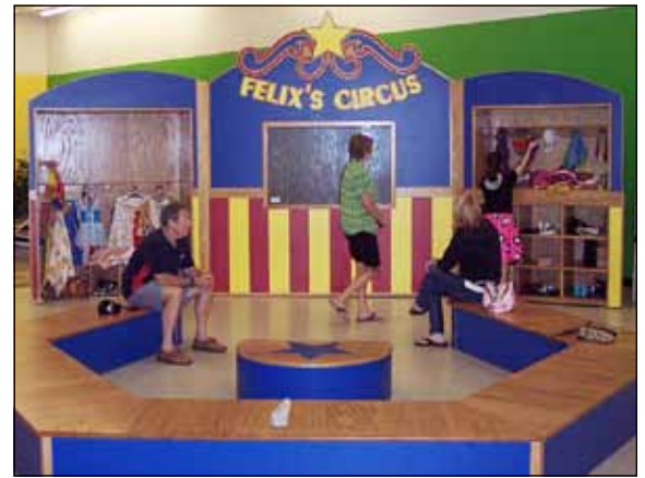
Phase Three: Interactive Performance Arena