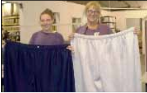
The BIG jeans and BIG sweatpants.

Adaptability and flexibility have always been two of Mitchellville Textiles Division's strongest assets. In keeping with our goal of meeting every customer's needs, Textiles recently produced several extra-