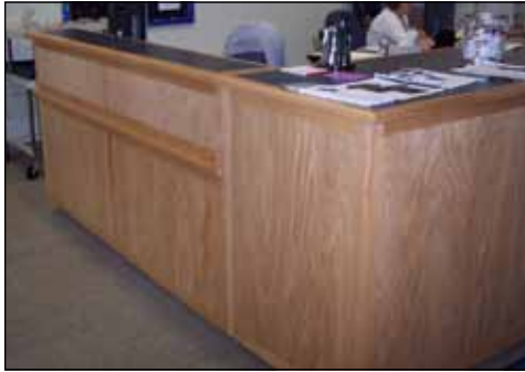
Anamosa Custom Wood manufactured reception & circulation desks to the school's specifications.