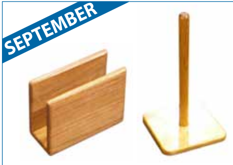
Paper Towel & Napkin Holders Regular Price: $5 - $6; Sale Price: $4 - $4.80