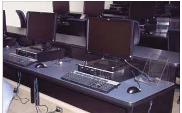
Custom bi-level computer tables were produced by Metal Furniture.