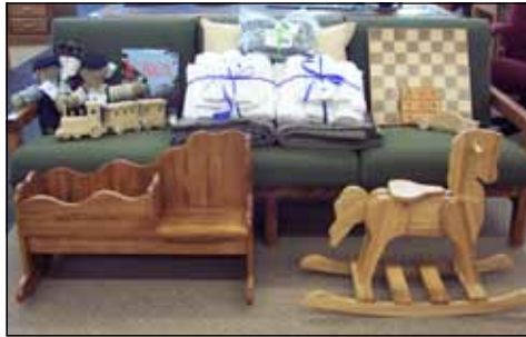
Shown above are the various items IPI donated to Unity Place in Des Moines.

Similarly, IPI was there to assist Polk County when the Des Moines YWCA shut