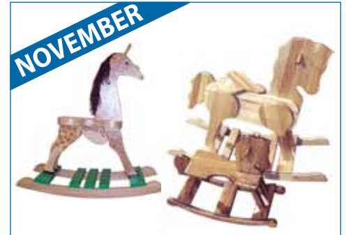
Rolling & Rocking Animals Regular Price: $40-$85; Sale Price: $32-$68