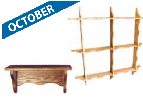
Shelves (Various Styles) Regular Price: $15-$31; Sale Price: $12-$24.80