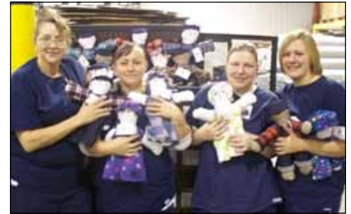
MTX offender employees with dolls they sewed outfits for and dressed to give away.

IPI also provides services to others on an everyday, ongoing, non-emergency basis. IPI continues to make and dress hundreds of dolls for the Governor’s holiday give-away to needy families. Each December, we provide a holiday gift bag for every single offender in the State of Iowa. We are currently assisting with a large-scale project for the children of Haiti by cutting up thousands of