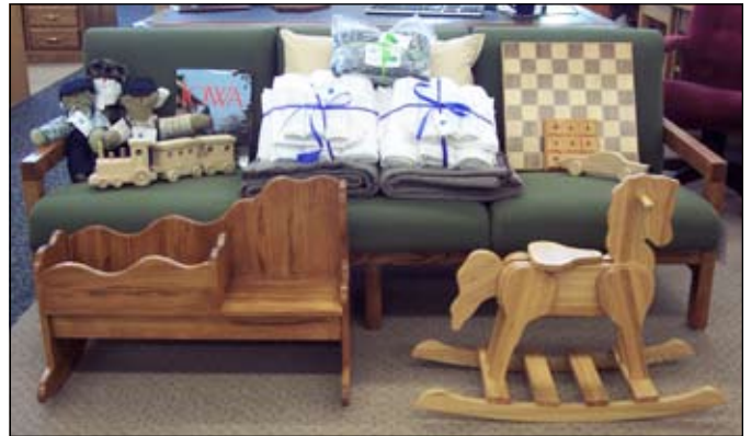
Donated toys to the Unity Place children included rocking horses, dolls and doll cradles, trains, checkerboards and cars. Bed & bath items were also provided for all the apartments.

Iowa Prison Industries is grateful to the Polk County Housing Authority to be given the opportunity to be a part of Unity Place project.