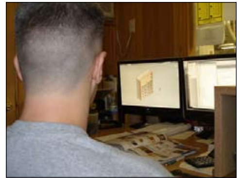
An inmate CAD operator works on a custom drawing for a customer project.