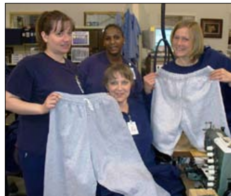
MTX Offender employees with IPI sweatpants and shorts.

Along with producing shorts and sweatpants, IPI MTX has also started producing jean jackets for institutional state issue. In the future, we look forward