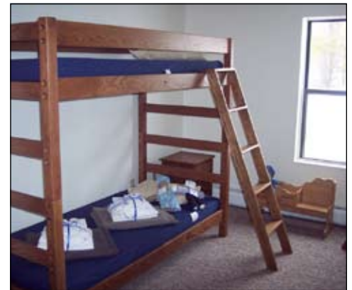
A sample bedroom at Unity Place.

NEW Business For 2010: Remanufactured Printer Cartridges www.greencartridgeiowa.com