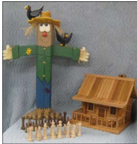
Custom Wood's new novelty items are available to purchase in the IPI Showroom in Des Moines or directly from Anamosa office.