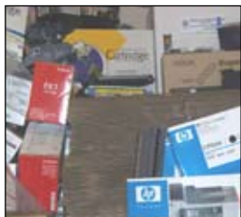
One small corner of the IPI Cartridge Recycling Center.

In our latest venture, we are serving as the cartridge collection and remanufacturing center for all Iowa state agencies.