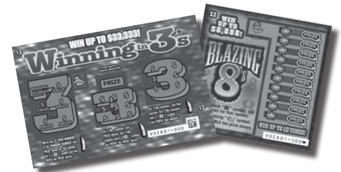
The last top prizes were claimed in the "Winning in 3's" and "Blazing 8's" scratch games in February and the lottery ended both games.

Some retailers may not be familiar with what goes on behind the scenes at the lottery as