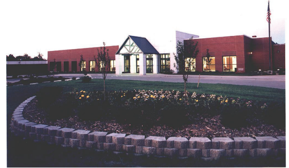
Van Buren County Hospital

I always enjoy this time of the year, trying to fit in a few more summer activities with fall just around the corner; and receiving and reading all of the final reports submitted by the hospitals that received FLEX grant funding this past year. I feel very lucky to live in a state that has such caring and dedicated health care professionals. Iowa's Critical Access Hospitals are some of the best in the nation. I am honored to have the pleasure to work with them and share their success stories with others. This will be the first in a series of articles that will spotlight the good things happening in Iowa hospitals.