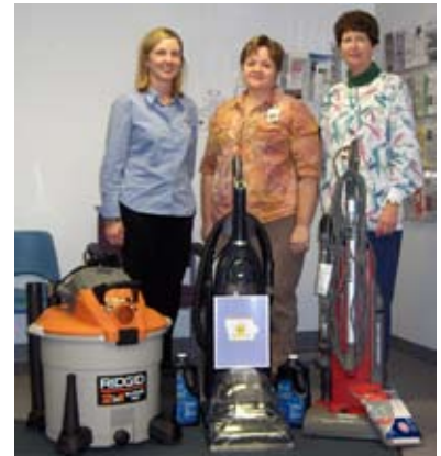
Howard County is ready to begin their healthy homes outreach project

Iowa's Healthy Homes Initiative officially started in September 2007 with funding from the Centers for Disease Control and Prevention (CDC). Housed in the Bureau of Environmental Health Services, the overall goal of the Healthy Homes Initiative is to facilitate a holistic approach to housing and health issues faced by Iowans. Activities of this initiative include: 1) Providing training on housing issues to local environmental health staff, 2) Developing educational opportunities and materials for rural and Spanish-speaking Iowans and 3) Facilitating a statewide advisory committee to determine the future of healthy homes in Iowa.