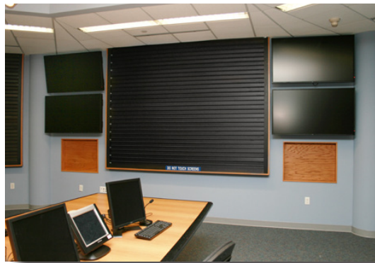
New flat screen televisions in the SEOC.