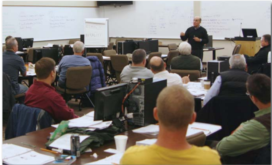
Participants in the EOC-IMT course, held Dec. 7-10 at the Polk County Emergency Operations Center.

For the purposes of training in Des Moines, a planned event scenario brought an IMT to Polk County to assist with events surrounding the annual Iowa State Fair. Just some of the things that occurred during the exercise on day one: a child went missing, contaminated hot dogs were blamed for some fair-goers' illnesses, and a suspicious backpack was found at the airport, snarling traffic for hours. At the end of the first day and continuing on day two, teams were required to reassess their mission, reallocate/redistribute staff, and make some