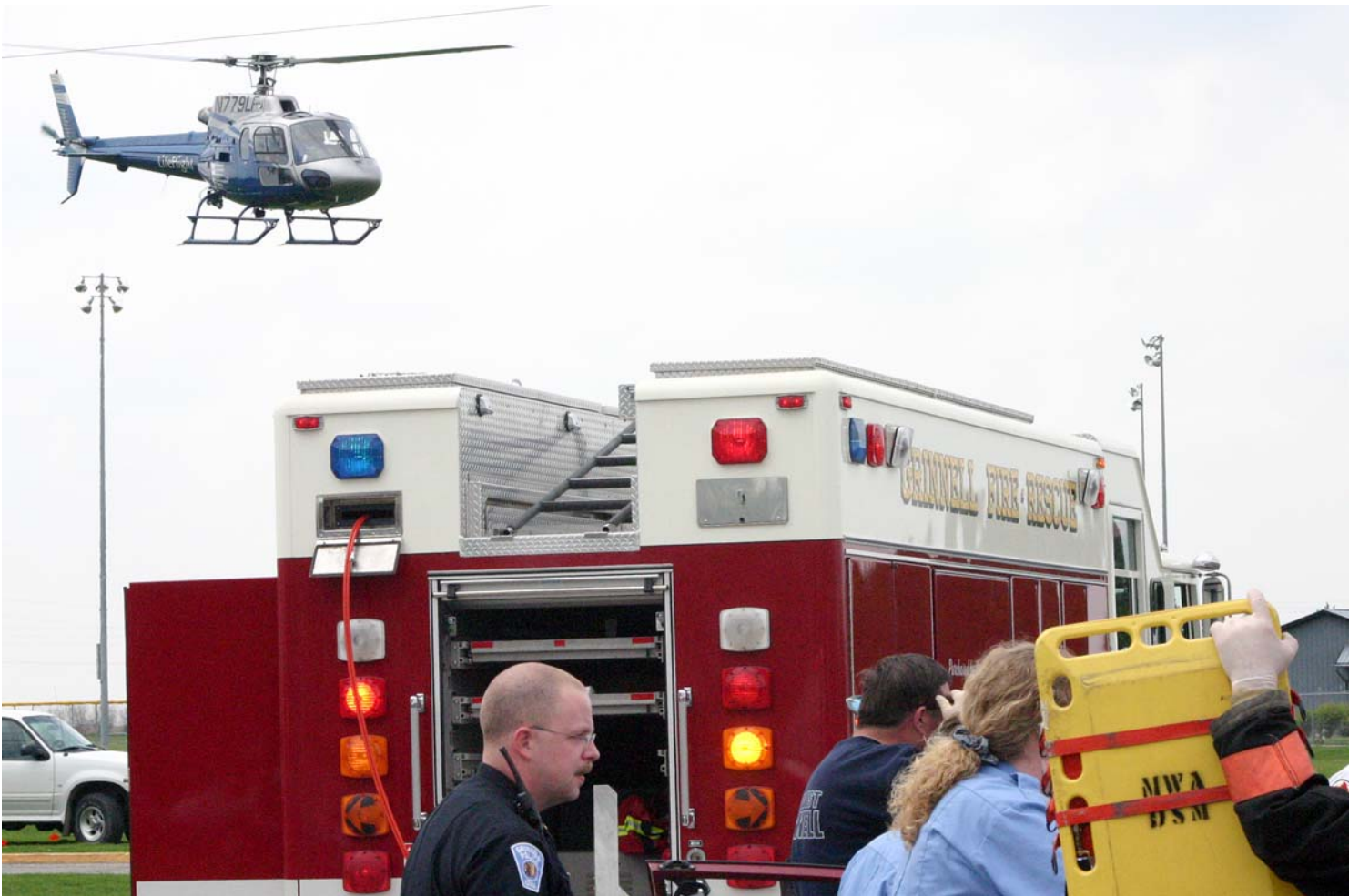
Life Flight arrives at the scene of an accident to transport a patient to a trauma center. Air ambulance programs play an important role in medical emergencies and augmenting the capabilities of rural community hospitals.