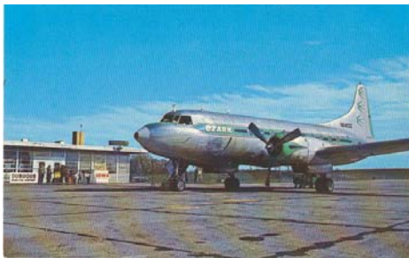
A trip down memory lane. Personnel at the Dubuque Regional Airport recently came across this picture depicting air service to Dubuque by Ozark airlines in the early to mid 1960s.