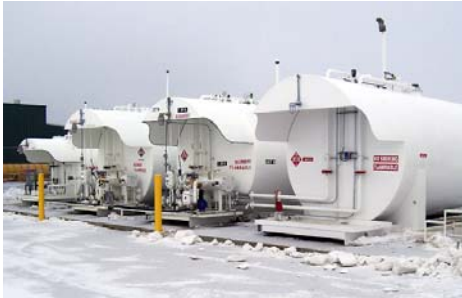
A new 20,000 gallon jet fuel tank adds fuel capacity at the Dubuque Regional Airport.

Dubuque Jet Center added a second jet fuel tank to the fuel farm. The new tank, which holds 20,000 gallons, went into service Feb. 1, 2005.