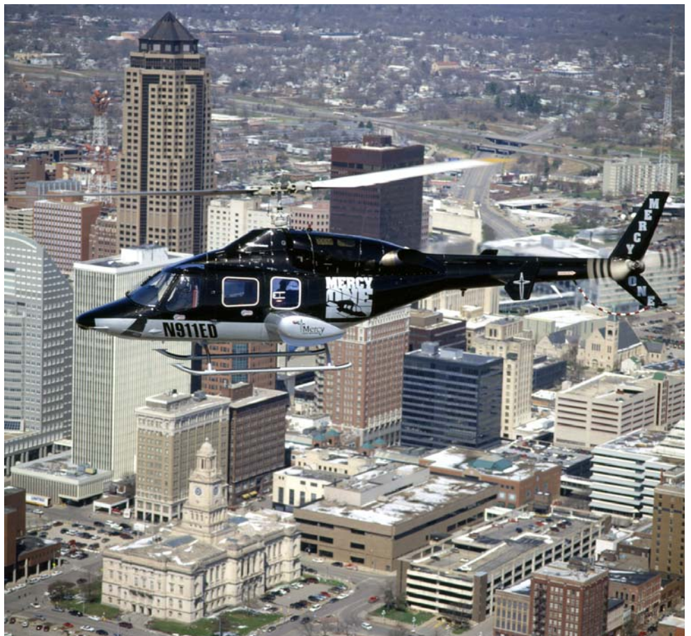
Mercy One flies over downtown Des Moines. Nearly 4000 missions are flown every year by helicopters serving hospitals around the state.

Additional independent and out-of-state hospital programs such as MED-FORCE in the Quad Cities area; Air Evac Lifeteam in Kirksville, Mo.; and Careflight in Sioux Falls, S.D. also provide rapid air transport to many areas of Iowa.