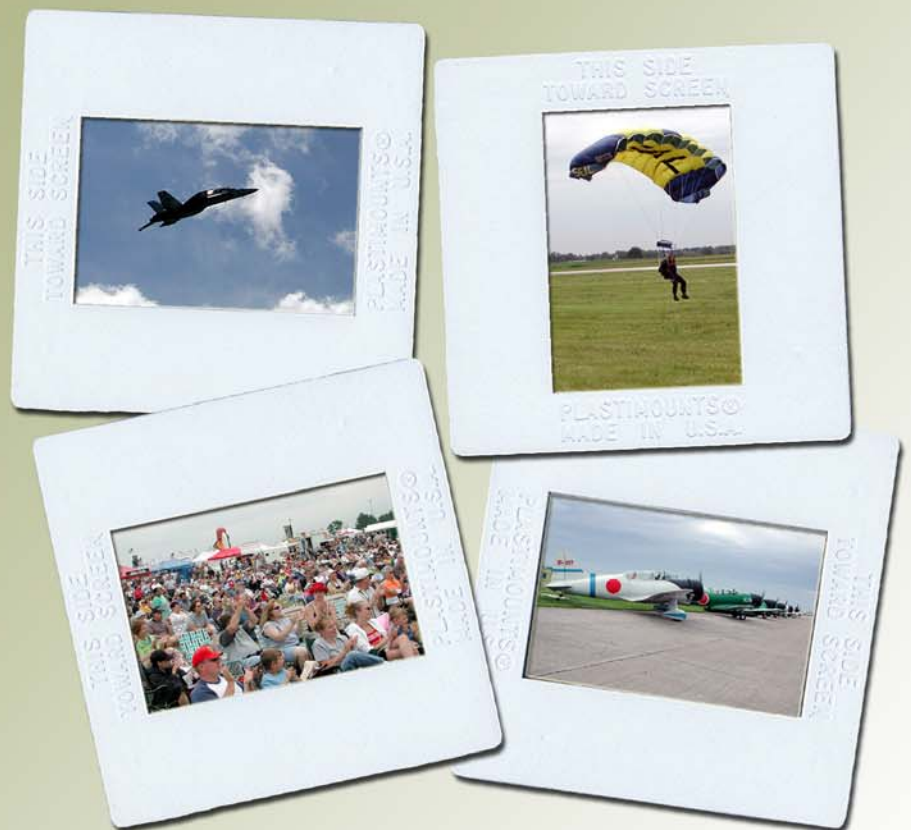
Scenes from the 2004 QC Airshow