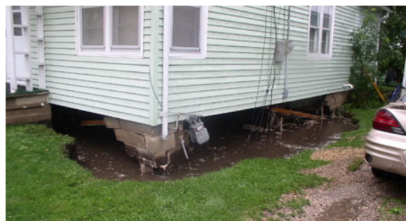
Damage sustained by the foundation of a home in Oelwein.