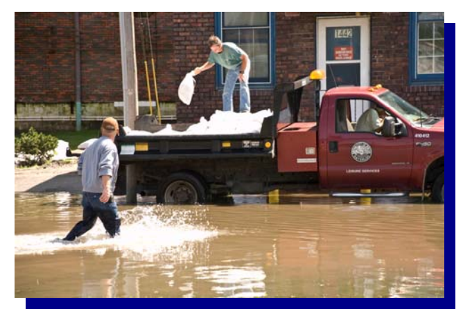
Waterloo residents distribute sandbags in June.

Small Business Administration Loans, $231.7 million;