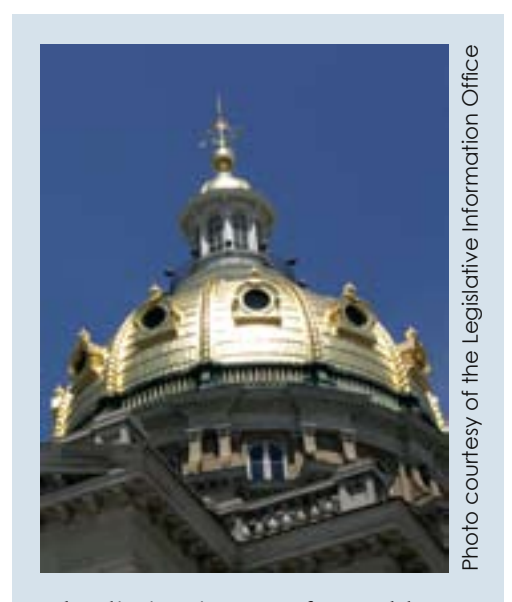
The distinctive 275-foot goldleafed dome of the Iowa State Capitol is 80 feet in diameter and the 23-karat gold is 1/250,000th of an inch thick. The Capitol was completed in 1886 at an original cost of less than $2.9 million.

Remember, your IPERS benefits are only one part of your overall retirement savings. Your total retirement income will come from a combination of your IPERS benefits, social security, personal savings, and any other retirement plan benefits.