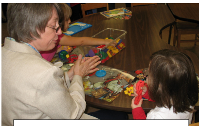
Enjoying 'playdough' Tacos!

On Friday morning, the Iowa Empowerment Board had the opportunity to tour two early childhood centers in the Mason City Community School District - Madison and Washington Early Learning Centers. These programs are a result of a long and fruitful partnership between Mason City Community School District and Head Start. In the true spirit of collaboration, Head Start classrooms are integrated and include children in both early childhood special and general education. Just down the hall was the Statewide Voluntary Preschool Program for Four Year Old Children. In all classrooms the children were busy and engaged with each other. It was obvious that skilled teachers and staff intentionally promote learning in this rich, quality learning environment. The IEB appreciated the openness of these two facilities in allowing the tours.