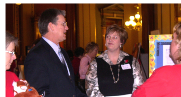
Senator Behn speaks with advocates from Boone County

On Valentine's Day 2008, in spite of the threat of yet another winter storm, over 300 early childhood advocates brought their unified message to the Statehouse for The Early Care, Health & Education Day on the Hill. Early Childhood Iowa (ECI), an alliance of stakeholders in early care, health and education systems that affect children age 0 to 5 in the state of Iowa, once again this year, organized the event ( www.earlychildhoodiowa.org ). True to its purpose, which is to support the development and integration of an early care, health and education system for Iowa, this event brought multiple partners to share the message that Quality Counts in their specific areas of the system.