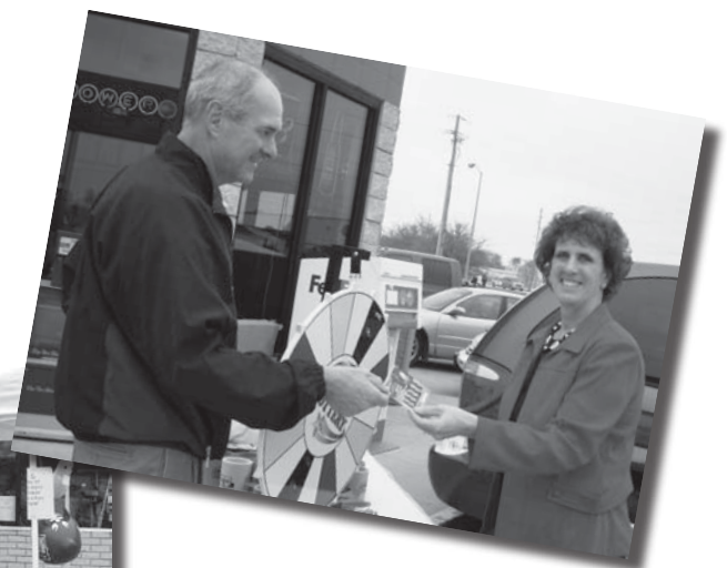
Above: A lottery player at Cubby's in Red Oak receives a free Indiana Jones scratch ticket after purchasing an Iowa's Million Dollar Raffle ticket.