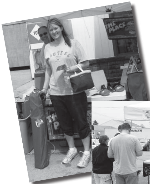
Above: A happy lottery player shows off the new "chair in a bag" that she won at KJ's in Maquoketa.