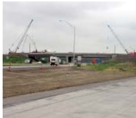
I-29 airport/Sergeant Bluff interchange

Construction work on the taxiway project in support of the Iowa Air National Guard conversion from F-16 to KC-135 air refuelers started mid-April. The project includes reconstruction of a portion of Taxiway Alpha, construction of a new portion of Taxiway Alpha, pavement of the Guard's fuel farm access road, and building removal/site restoration of the former Mid America Air Museum site.