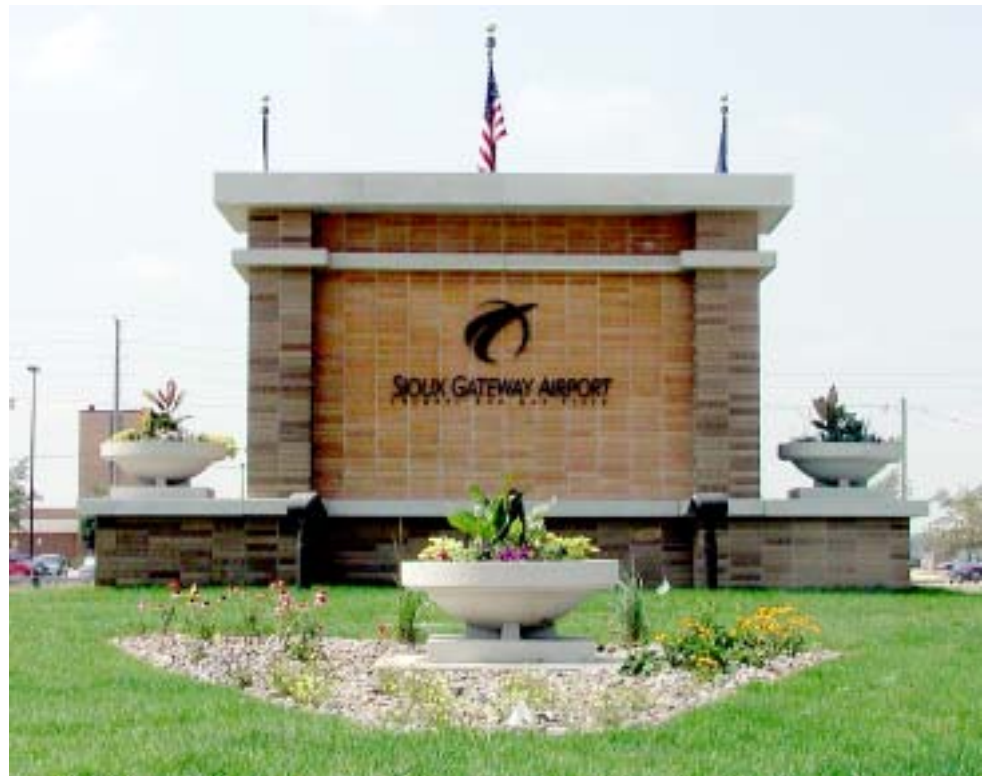
New entrance sign at Sioux Gateway Airport