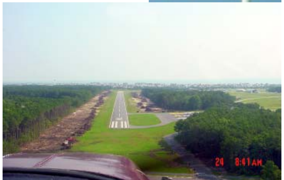
Approach to Kitty Hawk