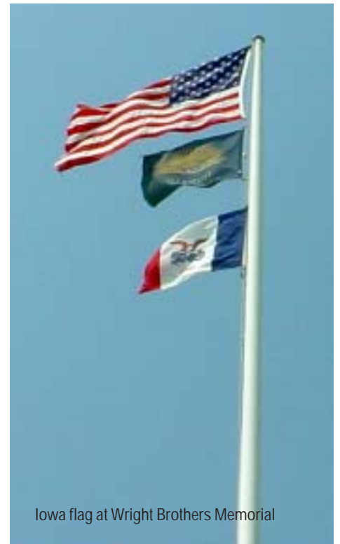
Iowa flag at Wright Brothers Memorial