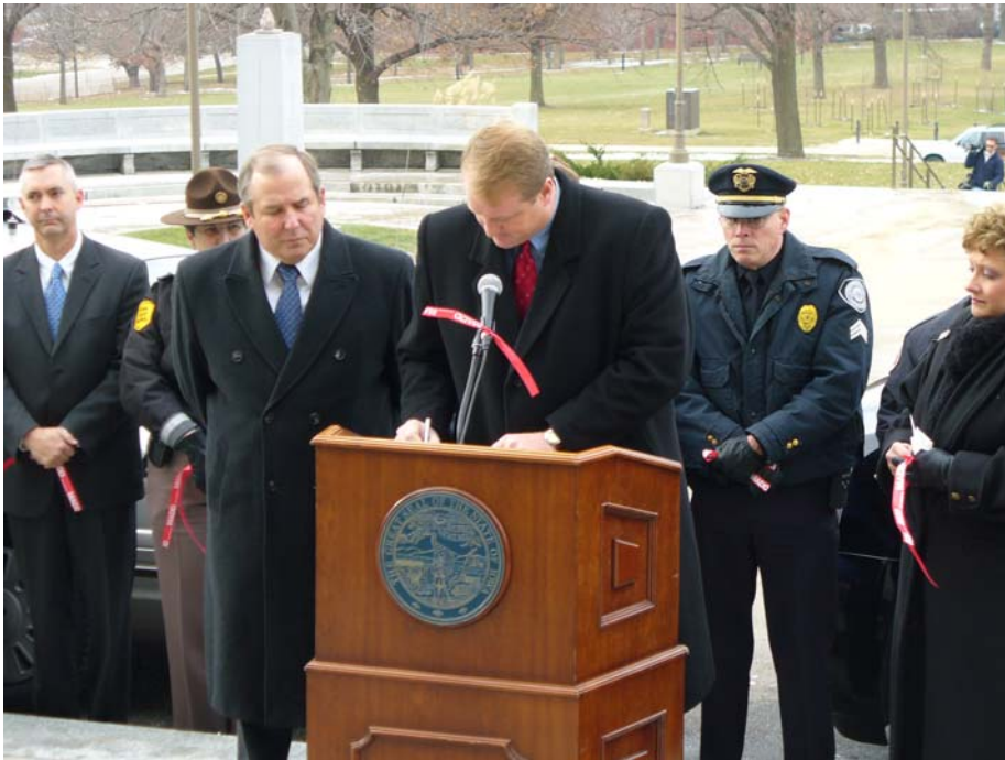
Red Ribbon Signing