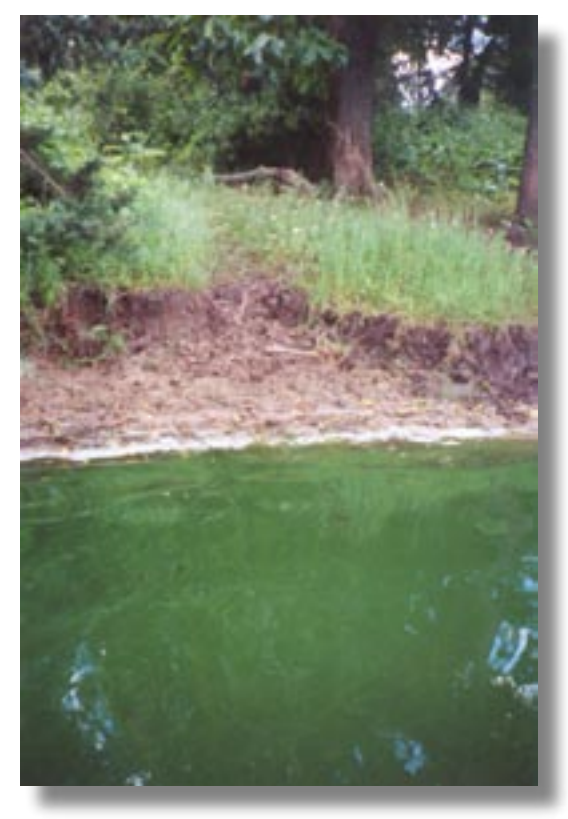
Silver Lake in Delaware County exhibits green water, characteristic of water bodies experiencing chronically high cyanobacteria concentrations.

Cyanobacteria or blue-green algae have recently grabbed headlines in a number of Midwestern states, including Iowa. While not a new phenomenon, scientists are just beginning to understand the relationship between cyanobacteria life cycles and their potential health impacts. The Iowa Department of Natural Resources (IDNR) and Iowa State University have jointly conducted monitoring for cyanobacteria and other phytoplankton density over the last five years. In addition, the toxin levels produced by cyanobacteria were monitored beginning in the summer of 2003, and results showed low levels statewide. Despite these low levels, there was cause for concern, as numerous reports had indicated high cyanotoxin levels in surrounding states. Therefore in 2004, the IDNR began its first intensive investigation into the occurrence of cyanotoxins in Iowa lakes, through research at Carter Lake in western Iowa. In the previous Iowa State University/IDNR studies, the cyanotoxin levels at Carter Lake, while not unusually high, were the highest recorded in any lake monitored in Iowa.