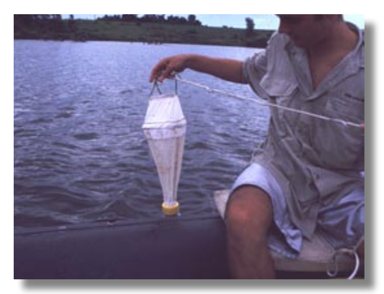
Cyanobacteria samples are often taken with a tow net at the same time as phytoplankton and zooplankton samples.