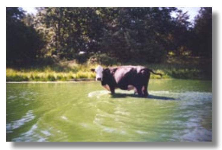
Animals usually do not discriminate against water contaminated with cyanobacteria.

working together with partners in their watershed to reduce inputs of nutrients that reach nearby lakes, streams, and ponds. Numerous best management practices can be promoted within individual neighborhoods and communities that can help improve water quality, including: