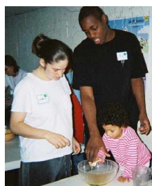
Making Omelets together

The morning we attended, the children, their parents and the Tri-County Child & Family educational specialists were creating breakfast. There were stations for making omelets, toast and Orange Julius shakes. It was a huge hit!