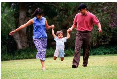
Parenting is the process of assuming major responsibility for the development, growth and nurturing of a child.

Part Two Coming in June: Who are Parent Educators and What is their Role?