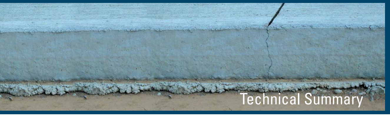
A summary of chapter 8 (pages 203–240) of the IMCP Manual (reference information on page 4)