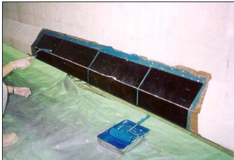
Installation of transverse CFRP jacket on Beam

Implementation: Results from this investigation will provide technical information that engineers in the bridge field can use to lengthen the useful life of structural concrete bridges.