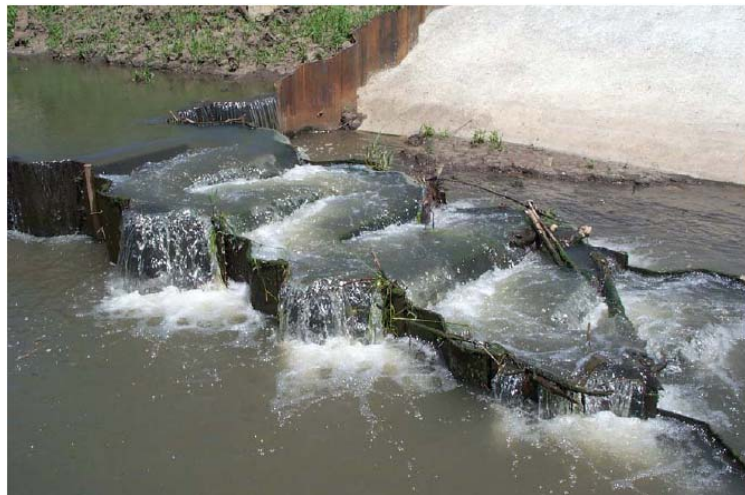
A plan/side panoramic view of a fish ladder

Implementation: This research will result in specifications and design criteria for constructing control structures which meet the needs of protecting bridges and facilitating fish passage.