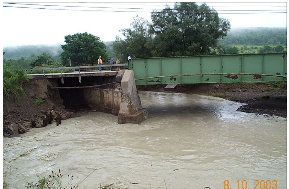
Waterway scour threatens bridge abutment and embankment.

Implementation: The primary product of this project will be a practical manual that will aid engineers to monitor bridge waterways. If deemed necessary, the manual could be introduced and explained in a workshop setting.