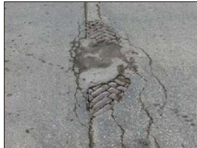
Asphalt Surface with Exposed Brick