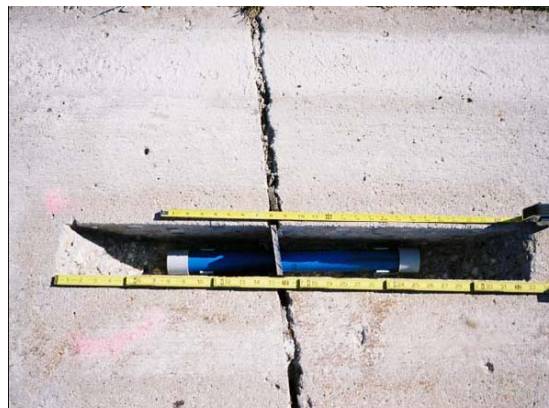
Proper Slot Length

The results of this research are expected to provide guidance to local government officials in the use of dowel bar retrofits as a method of rehabilitation. This will provide local governments with an alternative to extensive overlays or reconstruction of such pavements.