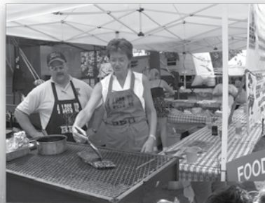
The Lt. Governor grills ribs at the 8th Annual Iowa State BBQ Championship in Marshalltown.