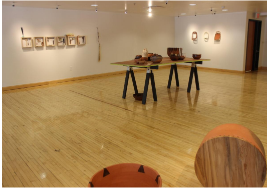
"Juncture," by Ellen Kleckner