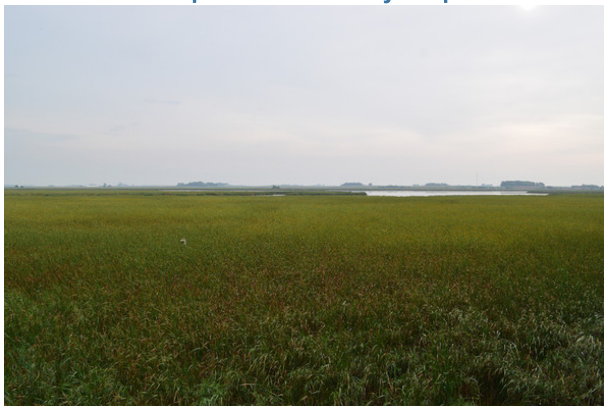
Boasting one of the largest natural marshes in the state, Eagle Lake, in central Hancock County, is home to all the usual wildlife found in north lowa as well as a number of rare or threatened species, and touring it by canoe or kayak in the

Often overlooked, Eagle Lake is a high quality North lowa wild place that's ready for prime time