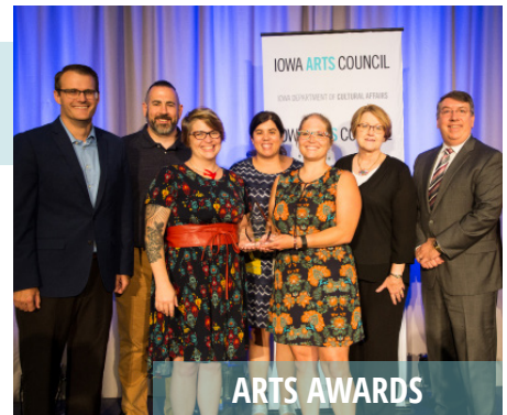
FACE of Mahaska County won a Governor's Arts Award at the 2018 Iowa Arts Summit.