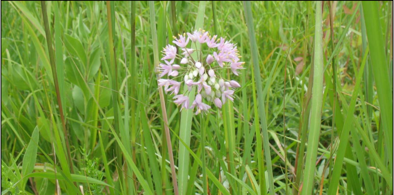
Iowa DNR Prairie Resource Center