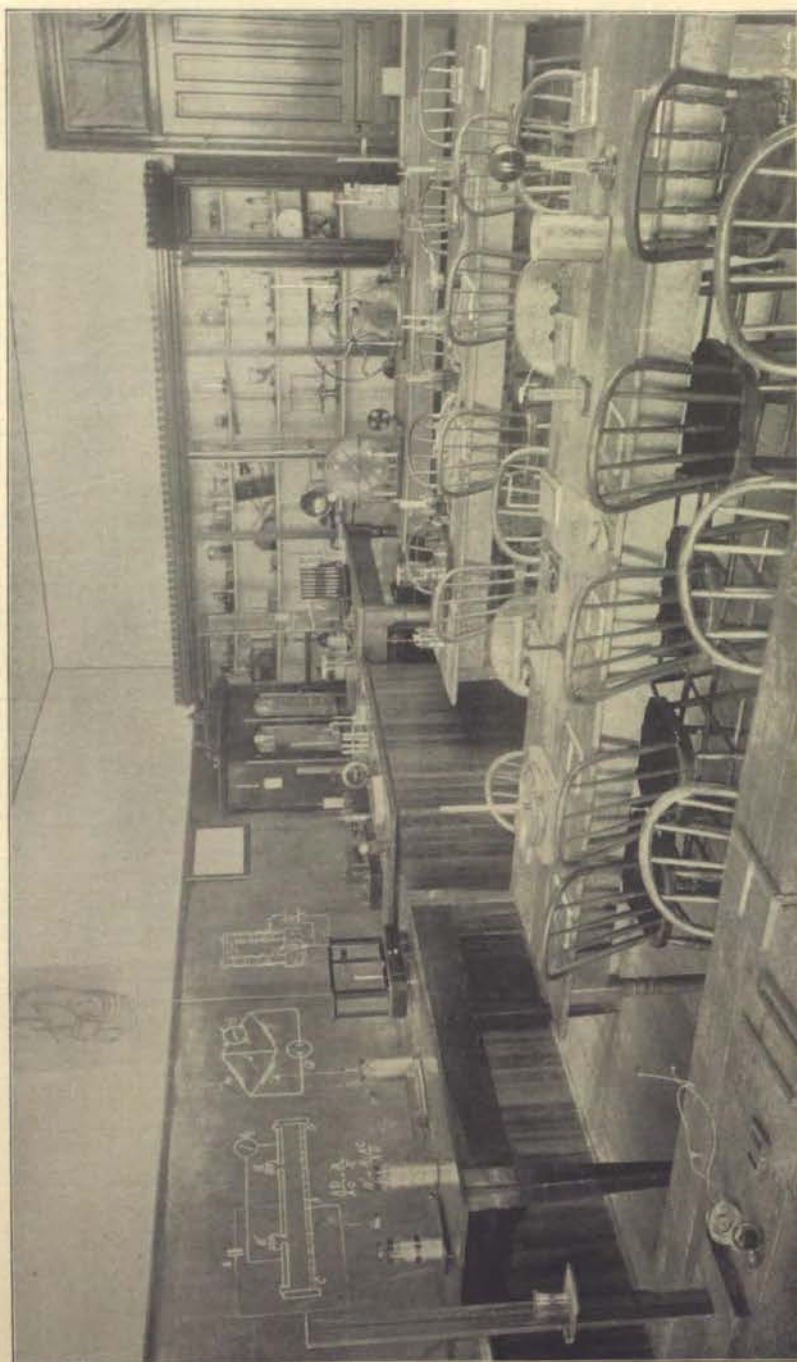
LABORATORY WORK—ELECTRICITY. IOWA STATE NORMAL SCHOOL.