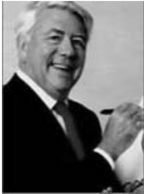
Cartoonist Mort Walker