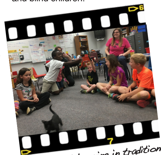
NERA offered learning in traditional and non-traditional settings.

teachers and staff. The Leadership Team will continue to evaluate the statewide system of educational services and opportunities for deaf and blind children.