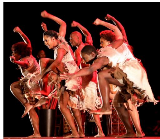
Pictured: The University of Iowa's Hancher Auditorium virtually premiered the Step Afrika! production " Stono " in September.

Nonprofit arts and cultural organizations, for-profit music venues, governmental and college/university cultural venues, and individual artists whose regular operations have been interrupted due to the pandemic may apply until Dec. 11, 2020 .