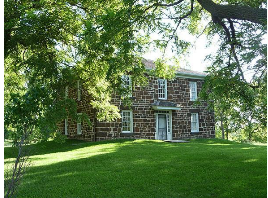
Pictured: The Hitchcock House in Lewis, Iowa, was a stop on the Underground Railroad.

Well, now somebody can. Iowa is one of only eight states to receive a federal grant to help rural communities revitalize historic properties and, in doing so, preserve local heritage and foster economic development. The State Historic Preservation Office recently received $600,000 to redistribute in historic preservation grants, funded by a $4.8 million grant from the National Park Service’s Paul Bruhn Historic Revitalization Grants Program.