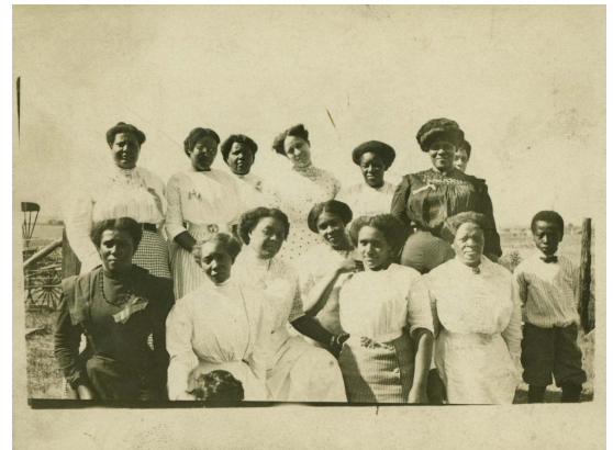
Pictured: A group of Buxton residents, ca1910.