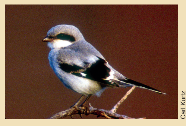
Songbirds such as the northern shrike and henslow's sparrow also benefit from field buffers.

The sign up is limited to "first-come, firstserved," and will end when all acres are enrolled.