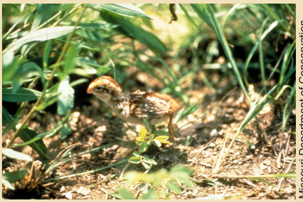
Open spaces between plants provide optimum cover to allow quail chicks and adults to travel undetected by predators. Chicks prefer 30 to 75 percent bare ground.

USDA is an equal opportunity employer and provider.