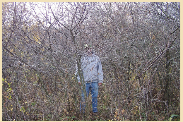
Quail need clumps of dense shrubby cover for daily protection, spending most of the winter within 70 feet of shrubby cover. Shrub plantings are optional and shall not exceed 10 percent of contract acreage.