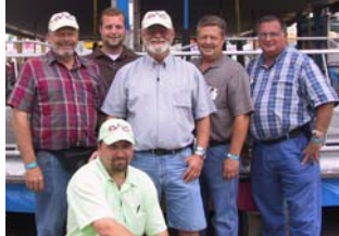
Inspecting amusement rides at the 2005 Iowa State Fair.