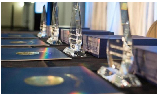
Governor's Arts Awards