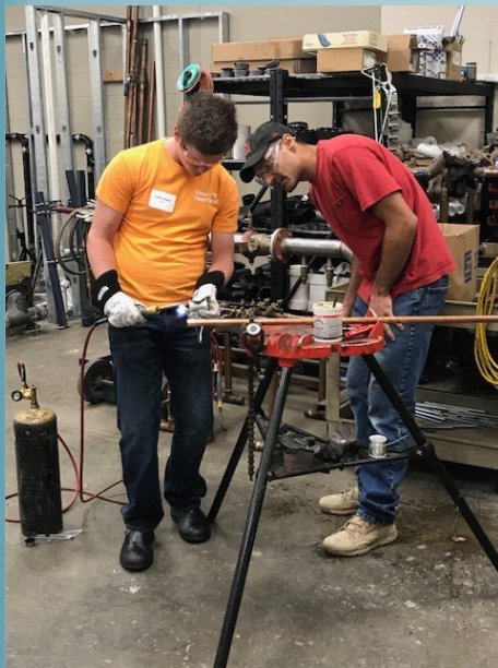
Student participating in a hands-on learning experience at a local apprenticeship program.

Iowa Vocational Rehabilitation Services (IVRS) works with students with barriers to employment by providing Pre-Employment Transition Services (Pre-ETS).