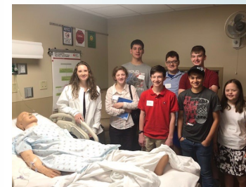
Students discovering postsecondary opportunities in a healthcare setting.