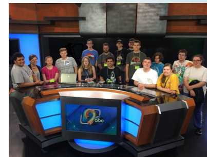
Students exploring career opportunities at a local news station.

Students learning culinary skills while engaging in a team building activity.