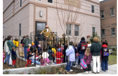
Back to top

The legislation requires high quality emergency operations plans for all public and accredited nonpublic schools, both district-wide and individual school buildings. The plans must include (but not limited to) responses to active shooter scenarios and natural disasters. The legislation also requires an emergency operations drill based on these plans in each individual building annually.