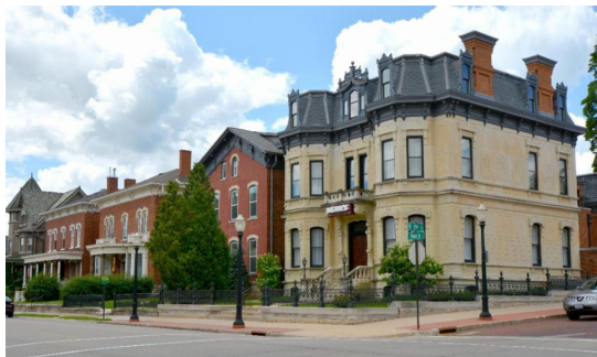
Preserve Iowa Summit Moves Online