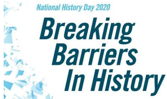
National History Day Goes Virtual