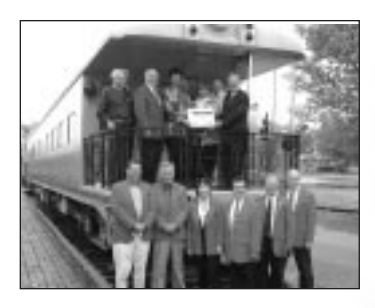
Nearly 100 people greeted the Lt. Governor in Boone. After a short program, the Lt. Governor took a moment for a group photo and a tour at the Boone and Scenic Valley Railroad.