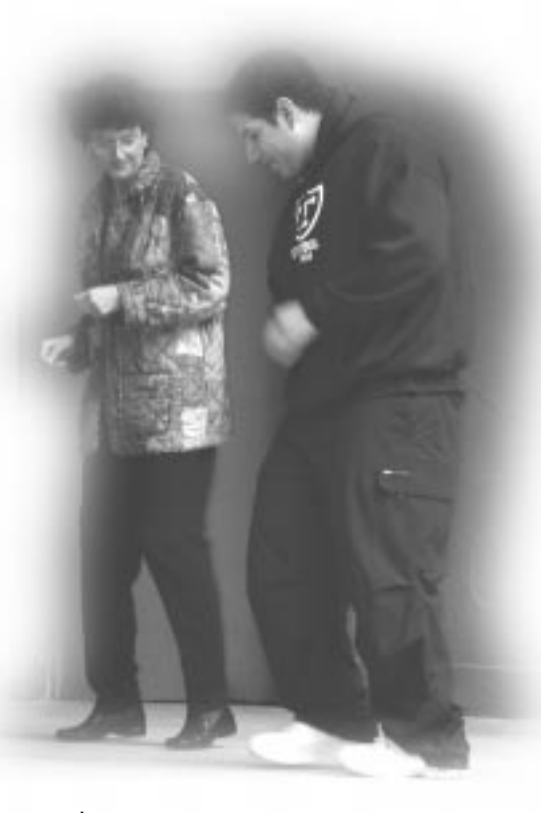
Lt. Governor Pederson tried her hand at Mexican dancing during a stop in Storm Lake. The community showcased its rich ethnic diversity at a lakeside community potluck at Sunset Park.