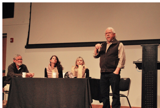
Conference participants enjoyed a reception at the Orpheum Theater and a Farmers’ Theater program developed by the University of Kentucky and presented by Iowa Valley Community College personnel.

Wednesday afternoon included 18 presenters in breakout sessions with a wide range of rural health and agricultural safety and health topics. Wednesday evening, conference participants enjoyed an Iowa wine and local foods reception at the Orpheum Theater. In addition to networking opportunities, they learned about a comfort dog program headquartered in Illinois that targets responders, and experienced a Farmers’ Theater program developed by the University of Kentucky and presented by Iowa Valley Community College personnel.