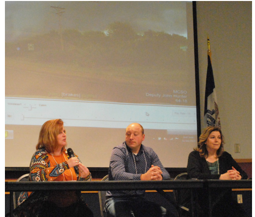
Marshall County Emergency Management staff shared lessons learned from their tornado response in July of 2018.

Small discussion groups gave participants an opportunity to begin applying what they learned at the conference for follow-up in their own work, and recommendations to consider for new projects.