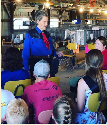
Dr. Temple Grandin provided a livestock handling presentation as part of the Delaware County Project.