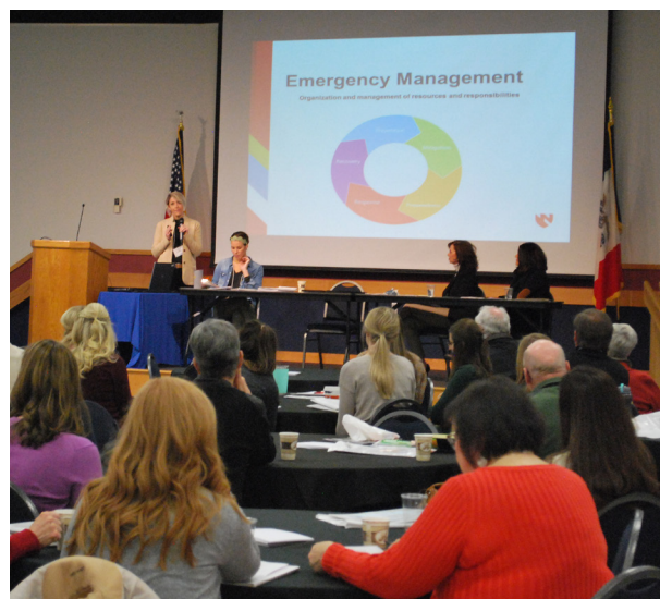
The MRASH keynote panel focused on immediate disaster response and long term consequences.