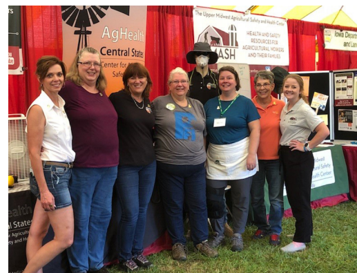
Health and Safety Tent staff from AgriSafe, Iowa Department of Public Health, CS-CASH, Iowa’s Center for Agricultural Safety and Health, GPCAH, and UMASH are ready to meet the Farm Progress Show attendees in Boone, IA.

In late July, the outreach team presented new agricultural health and safety “mini-displays” to Extension agents attending the National Association of County Agricultural Agents annual meeting in Chattanooga, TN. August was focused on rural roadway safety and identifying farmers’ health and safety concerns at the Minnesota Farmfest and the Farm Progress Show. These exhibits were in collaboration with the Central States Center for Agricultural Safety and Health (CS-CASH) and the Upper Midwest Agricultural Safety and Health Center (UMASH), the newest Agricultural Safety and Health Centers in the Midwest. The new lawn mowing safety display will debut on September 11-13 at Husker Harvest Days in Grand Island, NE. We’d love to see you at one of our future events - we’ll be at the Western Farm Show in Kansas City, MO on February 22-24, and the Triumph of Ag Expo in Omaha, NE on February 27-28. If you can’t make it to one of the shows, you can find all of our print materials on the resources pages on www.gpcab.org .