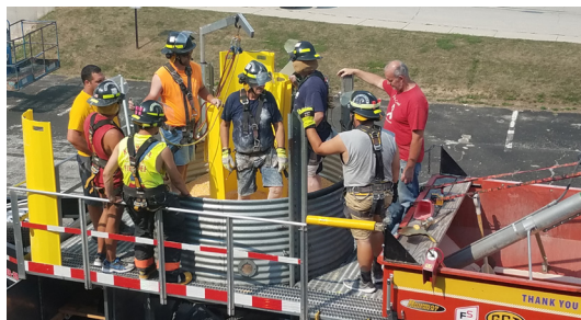
Staff from NECAS provided rescue training to the Kewaunee, WI Fire Department on August 11, 2018.

For more information on the NECAS visit www.necasag.org