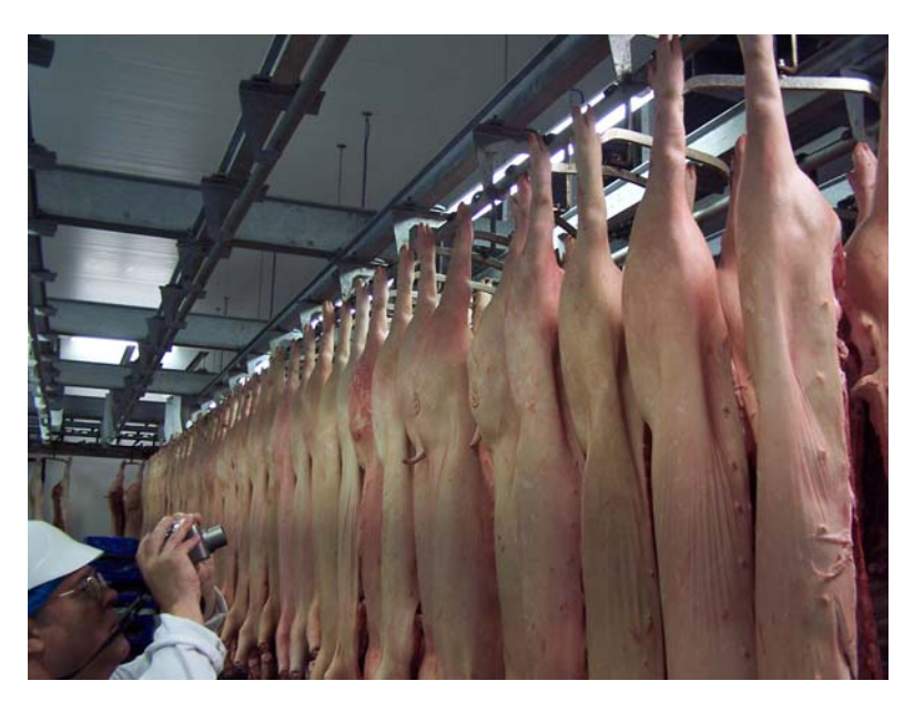
FIGURE 11. Hog carcasses on gambrels in the cooler