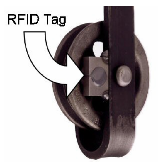
FIGURE 9. Gambrel radio frequency identification assembly

Following the 24-hour (minimum) cooling, the carcass is ready for processing. At this point, identification of individual carcasses is possible since the carcass is still carried by the gambrel containing the RFID chip. After leaving the cooler, the carcass is split and quartered (Figure 12). At this juncture, much of the meat is distributed to cutting stations without further identification or traceability; however, select cuts such as hams are tracked by placing the meat in bins that contain an embedded RFID tag (Figure 13). Information about the product is used to inform meat cutters about how each ham is to be processed during the initial stage of meat processing (Figure 14). The main focus of tracing the carcass to the cutting floor is for quality control, employee accountability, and precision cutting. Once primals are processed, individual pieces of meat are removed from the bins and sorted into aggregate bins by type, grade, and cut. As a result, individual animal traceability stops at the cutting floor and no information about the individual