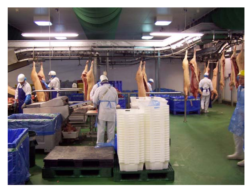
FIGURE 12. Carcass splitting and quartering