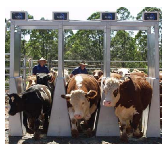
FIGURE 4. Walk-through reader, Destron Technologies, Inc.