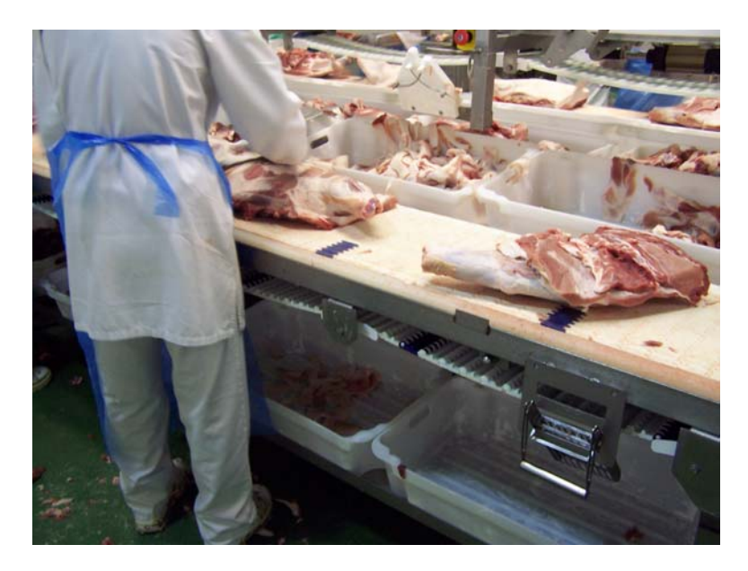
FIGURE 13. Tracking bins with hams and parts