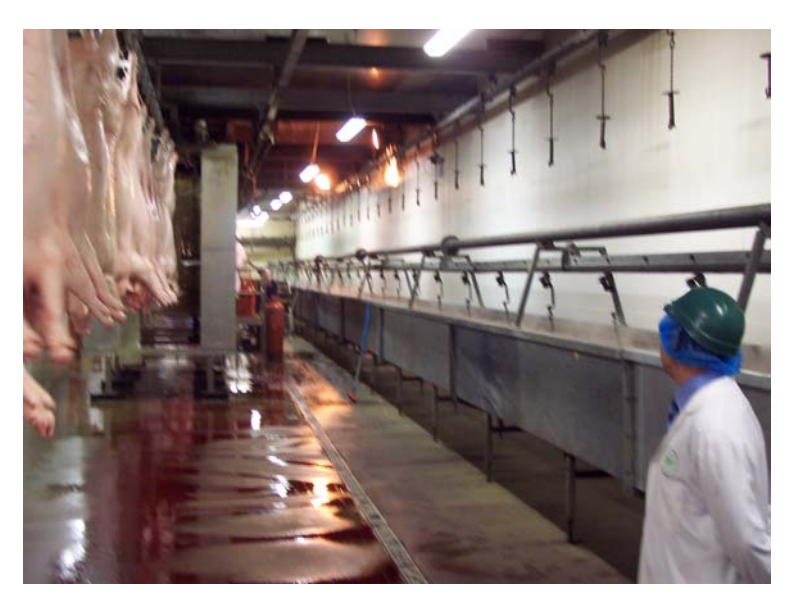
FIGURE 10. Hog carcasses in scalding tanks