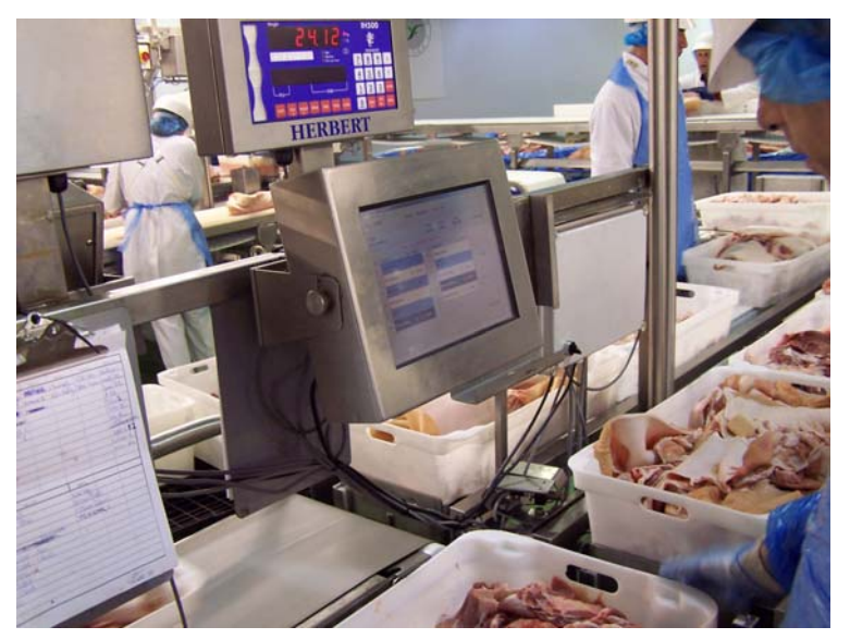
FIGURE 14. Computer monitors instructing meat cutters about how to process each ham

animal is carried through the system or associated with the final product. Discussions with managers at Dalehead reveal that there is interest in tracing select cuts further through the production process; however, there is currently insufficient demand for information about animal characteristics and history to justify the investment in the technology and substantial plant redesign required to enable full trace-back to the individual animal.