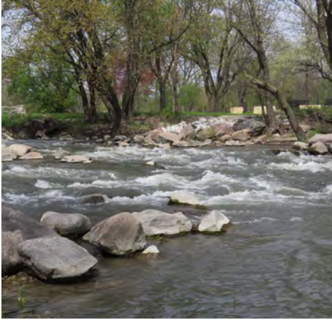
Story City rock riffle dam

Between Story City and the Lekwa Access the river meanders along a mostly wooded corridor of bottomland trees, silver maple mixed with some cottonwood, box elder, and sycamores. Some houses are visible along the shoreline and a bike/pedestrian bridge crosses the river within Story City limits. Deer are common and beaver-chiseled trees are found along the shoreline. The rock rapids at Story City Park were developed below the dam to improve habitat for fish and invertebrates.