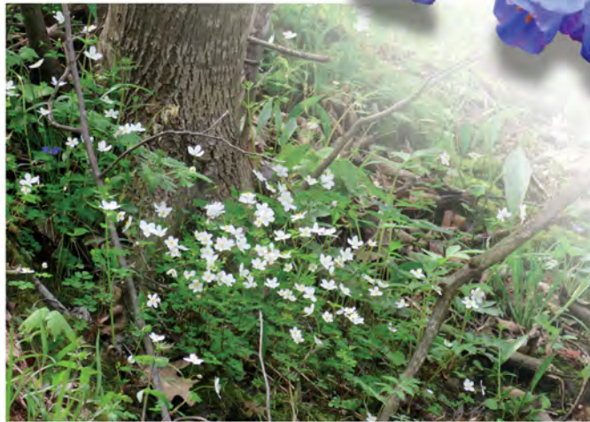
Anemones, violets, and other spring ephemerals