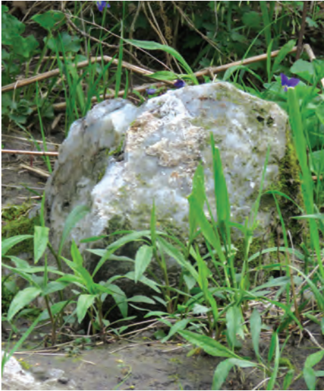
A chert nodule lies along the Skunk shore.

In places along the shore, low outcrops of limestone can be seen. Hard chert stones often were used by Native Americans for making tools. Today, paddlers just north of Sleepy Hollow may hear a loud boom occurring around 5:30 pm weekdays. It comes from modern mining of limestone near the Skunk River.