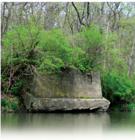
Remaining bridge abutments