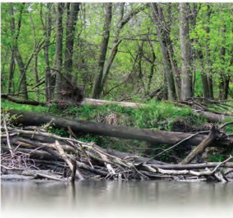
Dead trees in the water provide habitat and hazard.

The Skunk contains lots of fallen trees, often piled up in river meanders or hung up on sand and gravel bars. The brush provides important habitat for aquatic wildlife, but also may be hazards for paddlers.