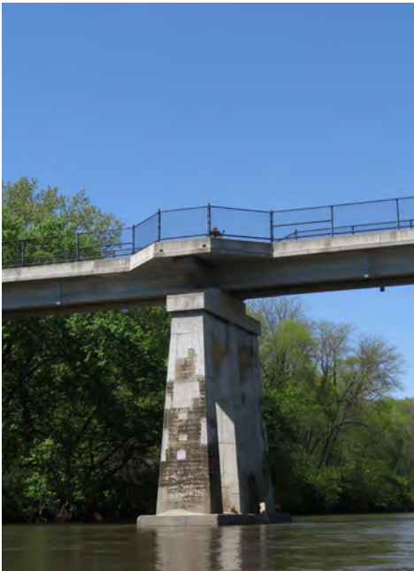
Heart of Iowa Nature Trail bridge

Although wildlife is less abundant than in the previous stretches, paddlers still are likely to see and hear some river animals. Canada geese, wood ducks, mallard ducks, and some bald eagles can all be found. Evidence of deer and raccoons can be seen in tracks and trails on the shoreline. Red-headed woodpeckers, song sparrows, and gold finches, all typical of more open woodland and savanna, can also be seen and heard along the route.