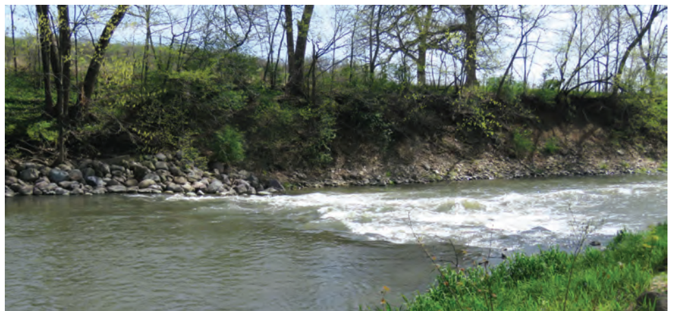
Soper’s Mill rock riffle dam

Dams and bridges are part of the history of the Skunk River. Paddlers will notice a bridge built by the CCC in the 1930s at Story City. Remains of bridge abutments and a mill dam remain at Soper’s Mill. A low-head dam where a mill once stood still can be seen near the Sleepy Hollow Access.