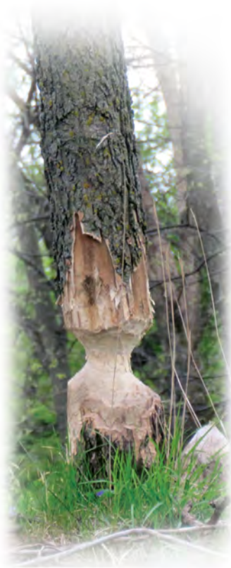
Signs of beaver activity

This river stretch is appropriate for paddlers of all skill levels.