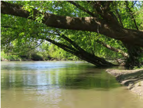
Shading silver maples

After passing under the Southeast 16th St. and U.S. Highway 30 bridges, the river flows along the southern edge of the City of Ames. The first third of this stretch is wooded with both bottomland and upland hardwoods. Below the Ames city limits, agricultural cropland dominates the landscape. River meanders are either hard-armored with old waste cement on the banks or are often actively eroding on the outside bends. Willows and other bottomland species occupy and hold the ground on the inside of the river bends. While some fields have grassed or treed buffers, others have none.