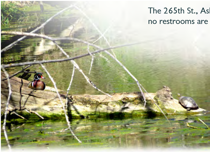
Wood duck drake and painted turtle

The 265th St., Askew Bridge, and C.J. Shrek Accesses provide ample parking but no restrooms are available.