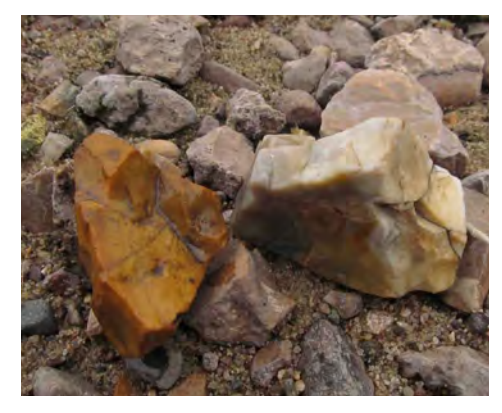
Chert and flint