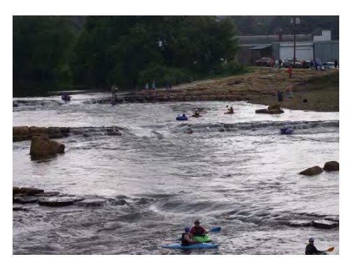
Manchester Whitewater Park