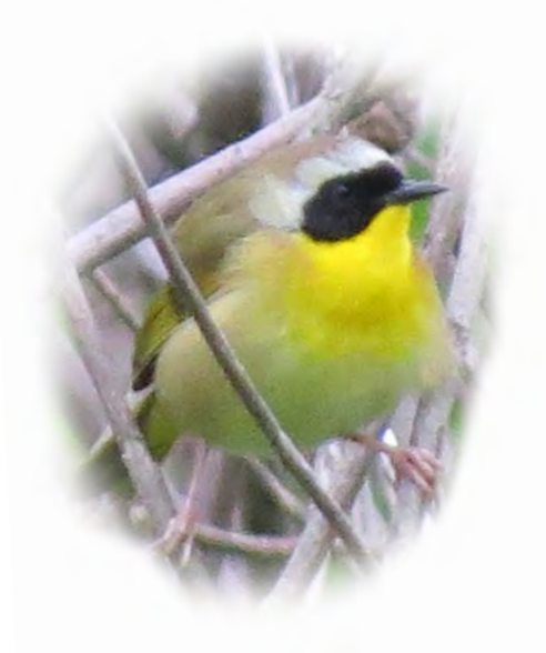
While paddling along areas with young groves of trees or shrubs listen for the unique song of the common yellowthroat. This small, black-masked warbler sings "witchity, witchity, wichity, WHICH!" Yellowthroats can be seen and heard throughout spring and summer along the Maquoketa.

ducks, Cooper's hawks and barred owls. Other wildlife also are common – deer, squirrels, turtles, and northern water snakes are likely to be seen. A few rock and sand beaches are found in this stretch and they are strewn with chert and flint nodules, and some appear to have been flaked by native cultures. Some large mussel shells are also found on these beaches.